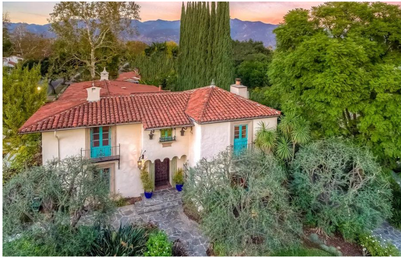
E. Lawrence Brown House, Pasadena, 1928.