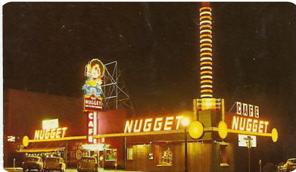
The Nugget Casino (1950s), Carson City, NV

The current owners report that when they purchased the house in 2011 it was fitted with safes and a "panic room".