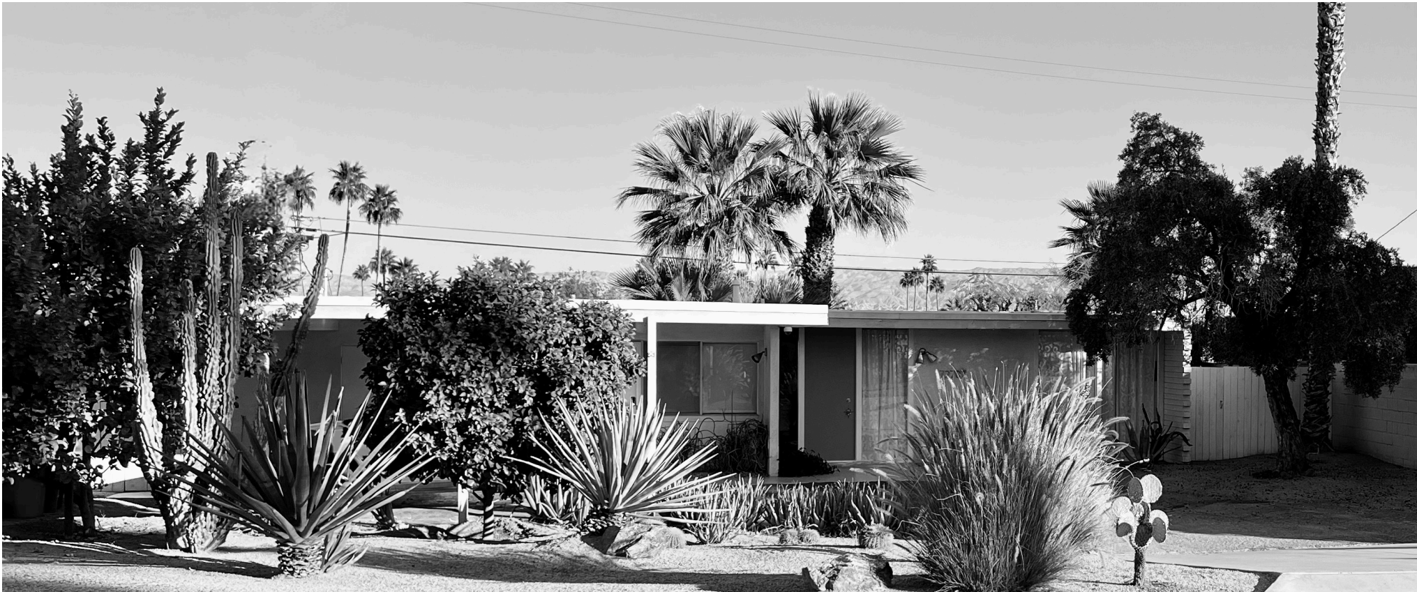
72707 Hedgehog, (1960) 1,578 square feet