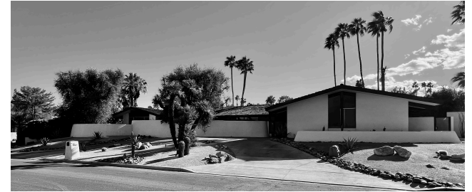
73307 Willow St., PD, (1965) The Contemporary Mediterranean Design home was part of the AAUW Home Tour in 1975.