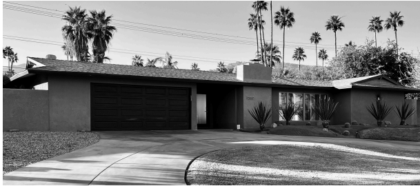
72957 Bursera Way, PD, (1961)