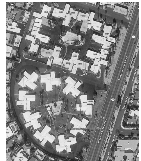
Upper circle area, S&S #2 was completed by Bissner & Pitchford, 1963. The lower circle, S&S #1 was completed by H.J. Bissner Sr., 1960.