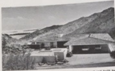
The Thomas Grilling hilltop residence in Southridge designed and built by Patten-Wild, Inc. Perlette marble was used throughout the large entry hall and dining area in this fine home. Views of the golf courses below and wide swaths of the desert as far as the lower end of the valley can be seen from the large curved window at the dining room.