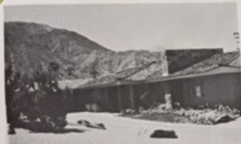
The Paul Diggle residence is on Fiddleneck Lane in Palm Desert. This house features a terraced patio of native stone, special golf cart storage, oriental roof lines and mortarless stone walls and fireplace. The home contains two bedrooms and a den plus three bathrooms.