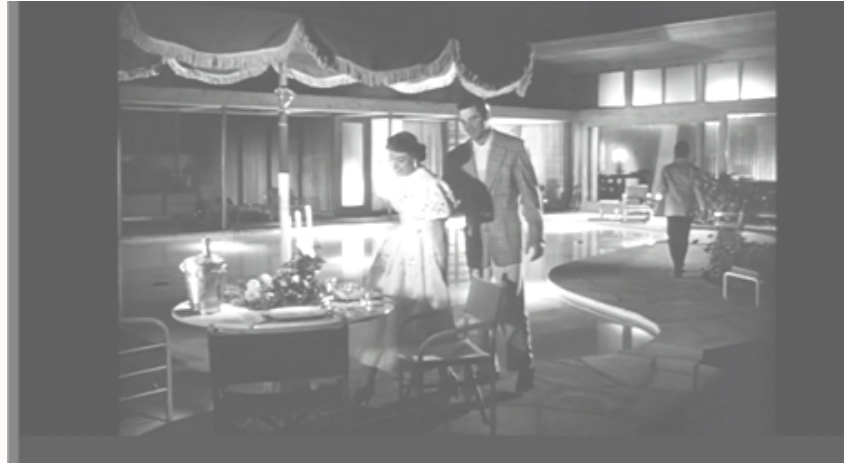
Poolside at Frank Sinatra House in Twin Palms, Palm Springs

A series of posters from Warner Brothers advertising the film were displayed in the lobby of the movie theaters. The cards were 11" x 14" posters that came in sets of 8. The Lobby Card Set: