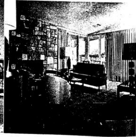
the center of the L-shaped living room is a ceiling-to-floor hearth wall, sofa at right angles to hearth wall has lamp table at one and and a offee table in front. Facing the modern sofa is a pair of open armchairs.