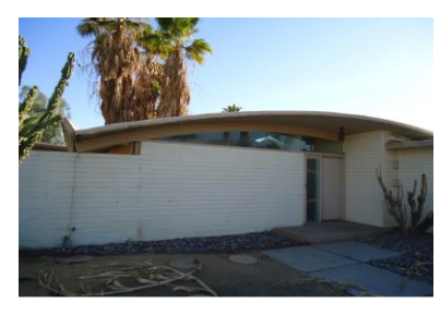
Miles Bates House in Palm Desert 2016

have been "remuddled" a bit, the long curving walls are gone and a room has been added to the front