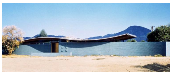
The Miles Bates House in Palm Desert 1955