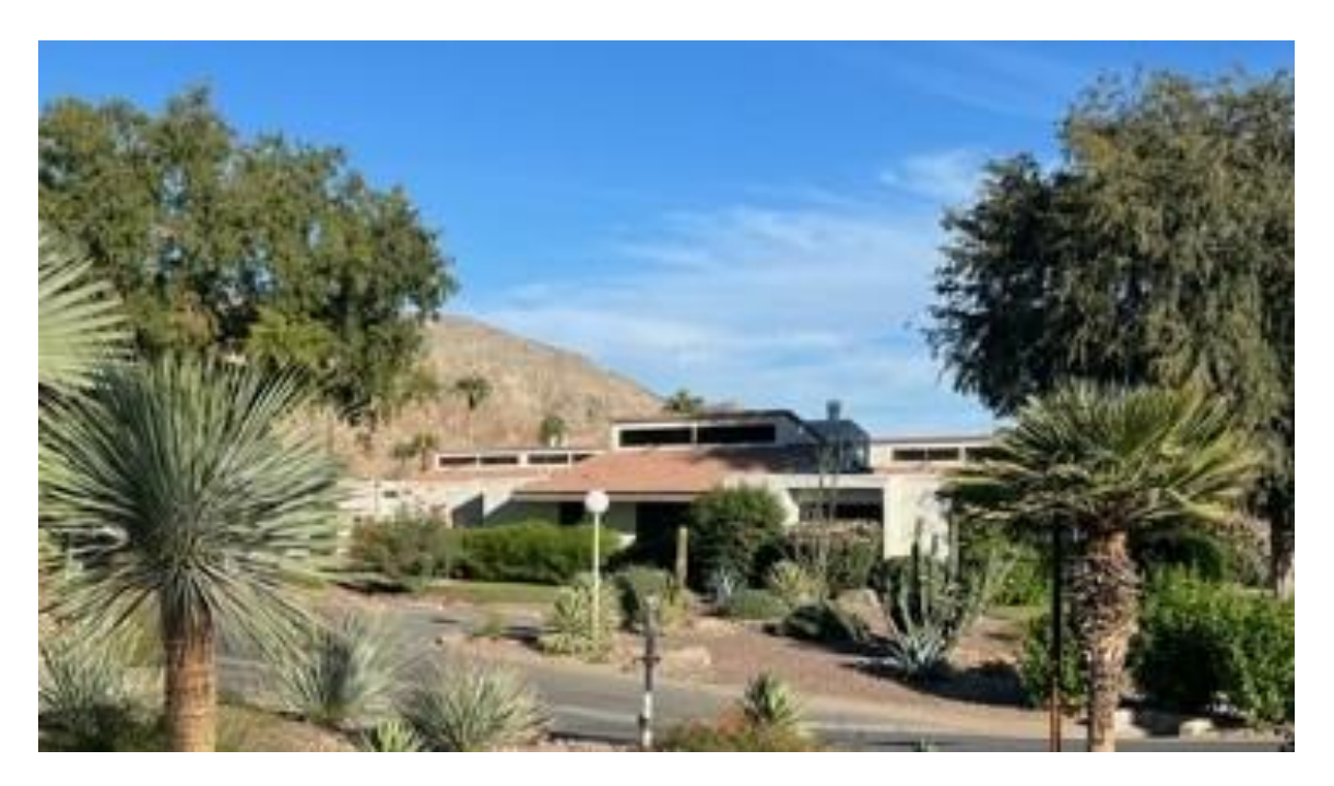
Kings Point condo